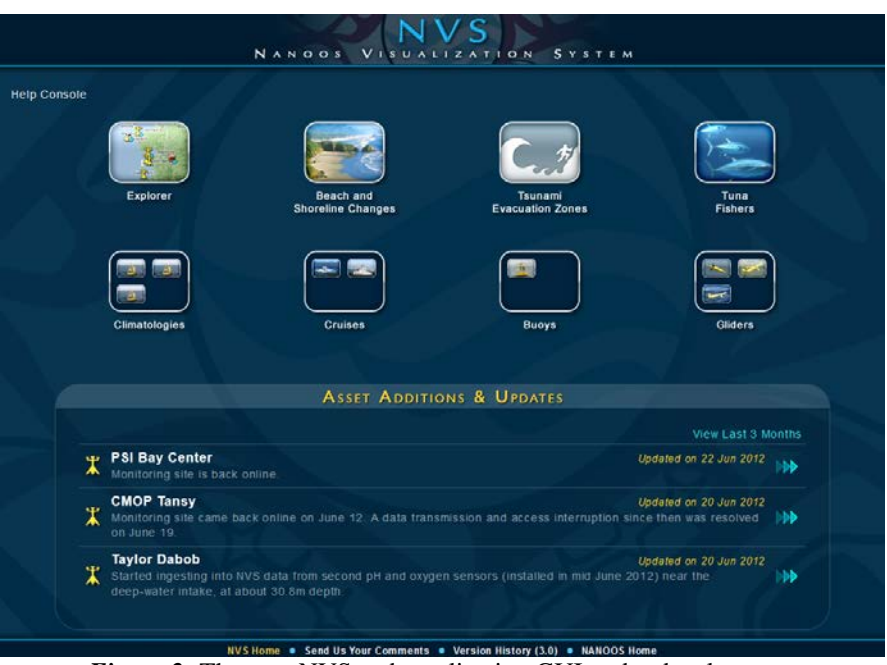
Figure 2: The new NVS web application GUI under development

coast. Work was also initiated during this period on an entirely new graphical user interface (GUI) to NANOOS products. Although not yet released, the new GUI is simpler and should enable easier access to existing NANOOS products. In addition, the new GUI will enable easier integration of future NANOOS web applications, planned for the coming year. For example, work commenced on a new Maritime Operation Web Application, which will