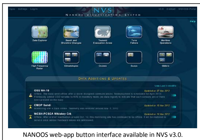
NANOOS web-app button interface available in NVS v3.0.

Following the NANOOS annual tri-committee meeting in June 2012, the decision was made to begin developing additional “web-apps”, targeting two specific user groups: shellfish growers and maritime users. However, to facilitate this shift to more customized web apps, members of the NANOOS DMAC-UPC-WEB-E&O team spent a considerable amount of time discussing the overall look and feel of the primary web interface, where the applications would be based. Following these discussions, an approach was